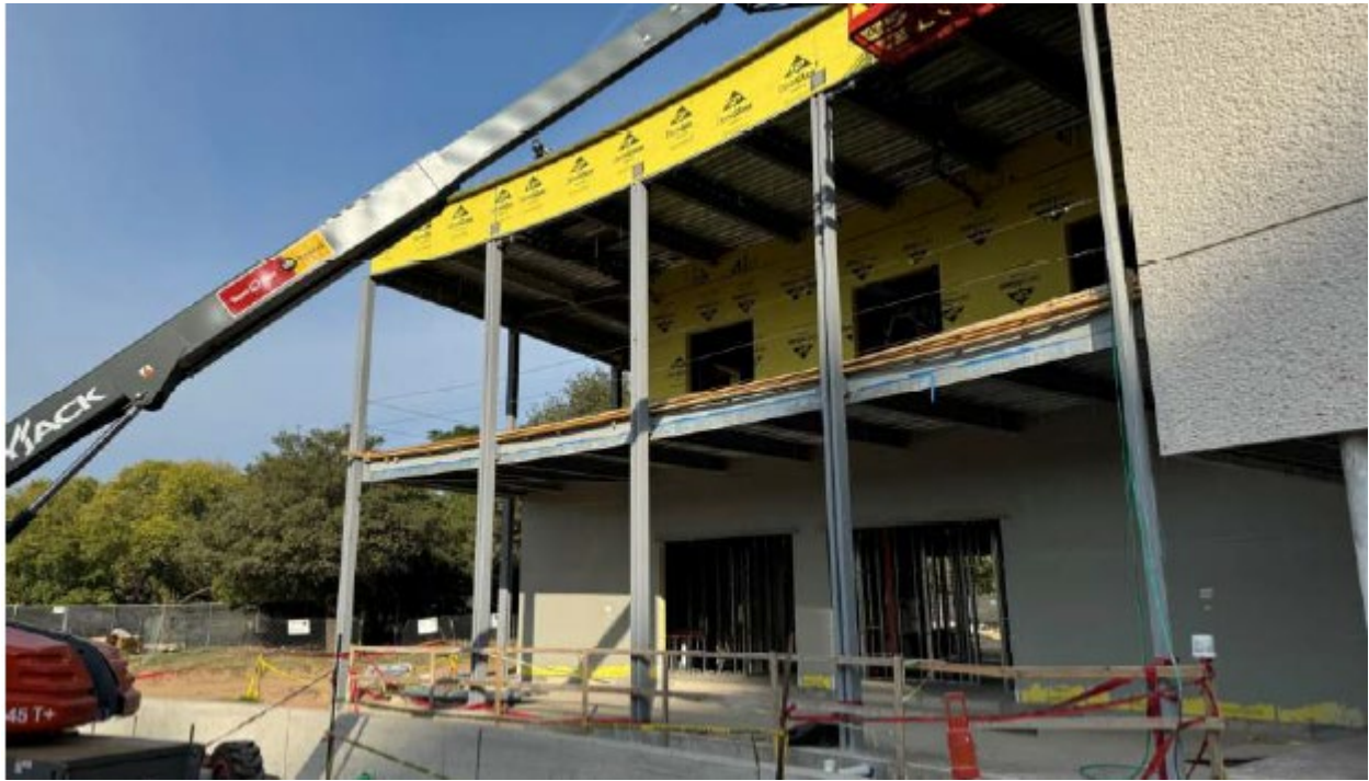
North Addition: Waterproofing in progress.