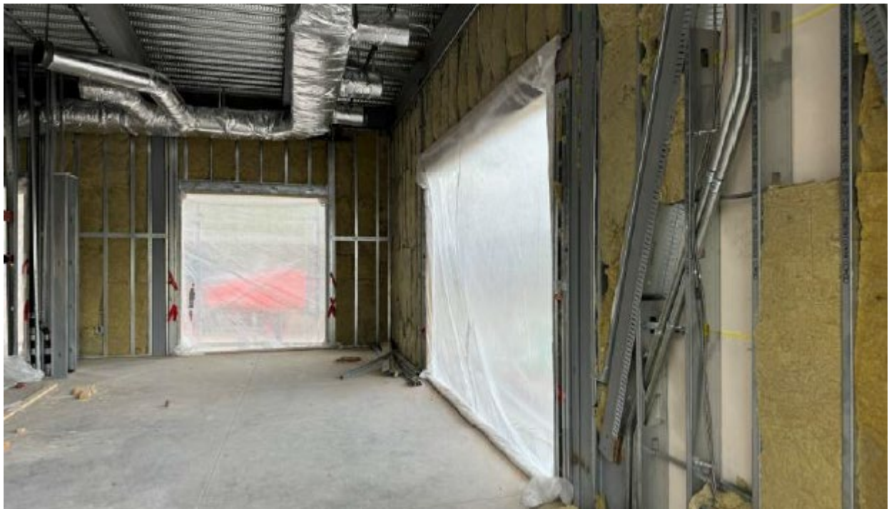
South Addition: Teaching Kitchen Insulation installation and openings protected.