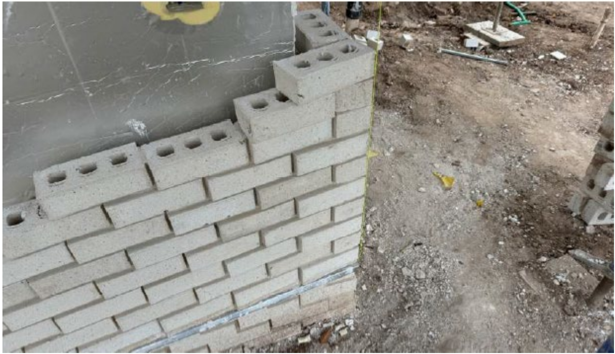
South Addition: Corner detail of brick installation.