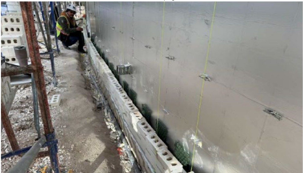
South Addition: Brick Installation.