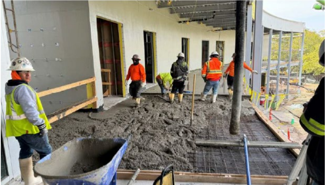
South Addition: Topping Slab at upper floor exterior walkway being poured and finish to be troweled.