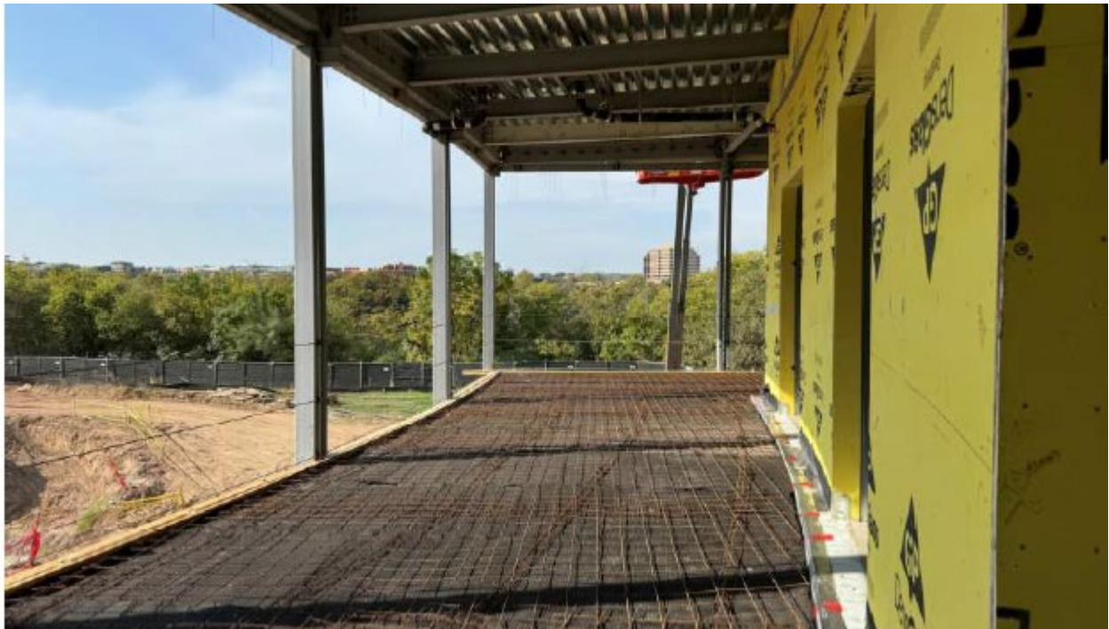
North Addition: Preparation for topping slab at upper-level walkway.