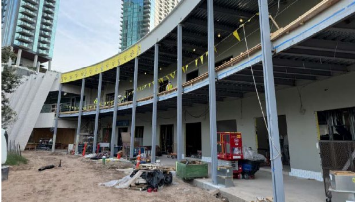
South Addition: View of progress.

For project updates, visit the project website: www.austintexas.gov/MaccPhase2