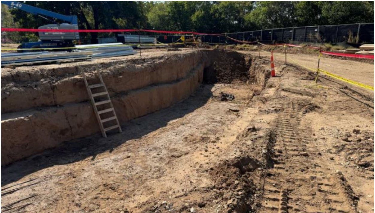
Zocalo: Excavation for stormwater lines