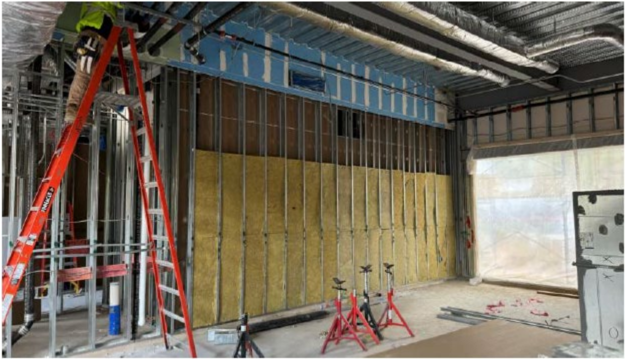
South Addition: Dance Studio acoustical insulation installation in progress.