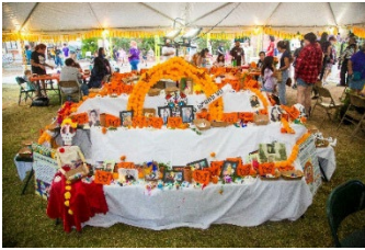
Dia de los Muertos- Saturday, November 1, 2025 Location TBD (ESB MACC)