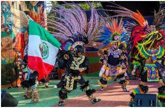
Viva Mexico - Saturday, Sept 13, 2025 Location TBD (Parque Zaragoza)