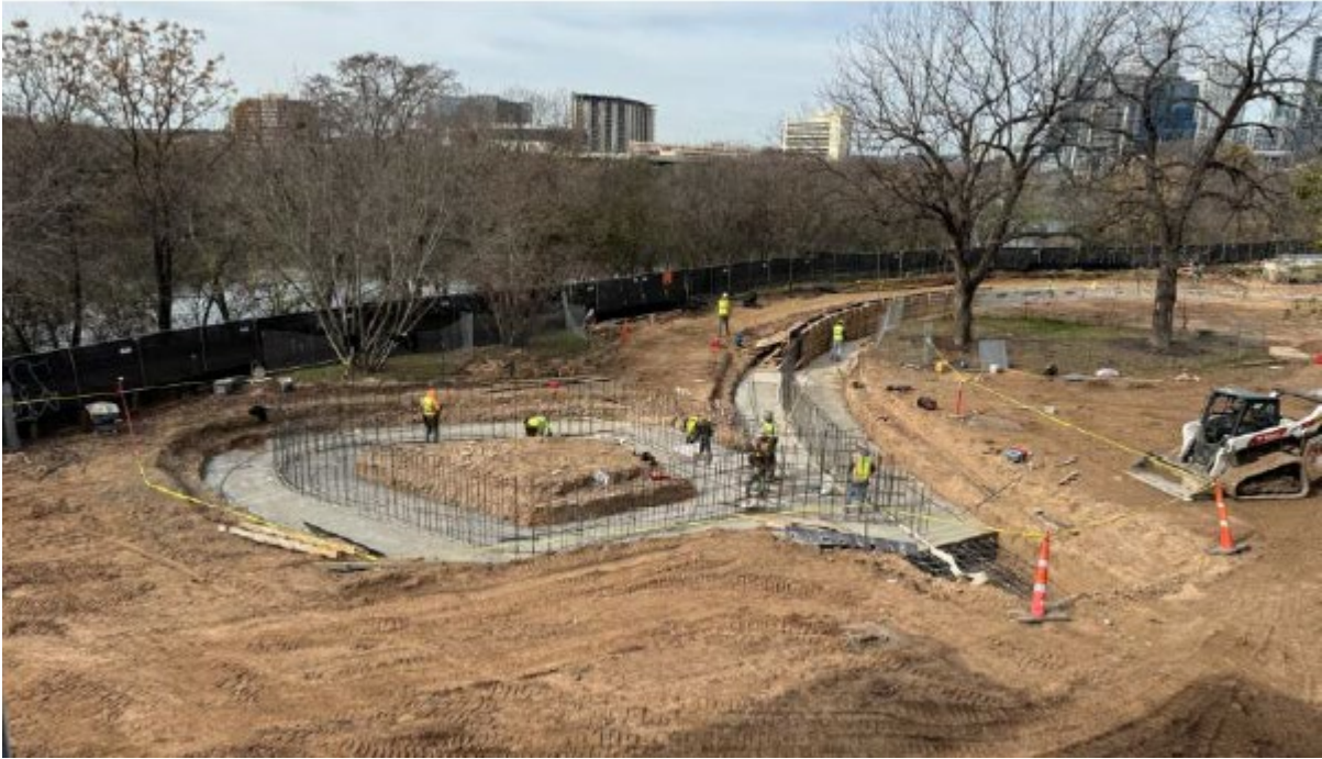
Zocalo: Retaining wall for re-installation of Snake Path.