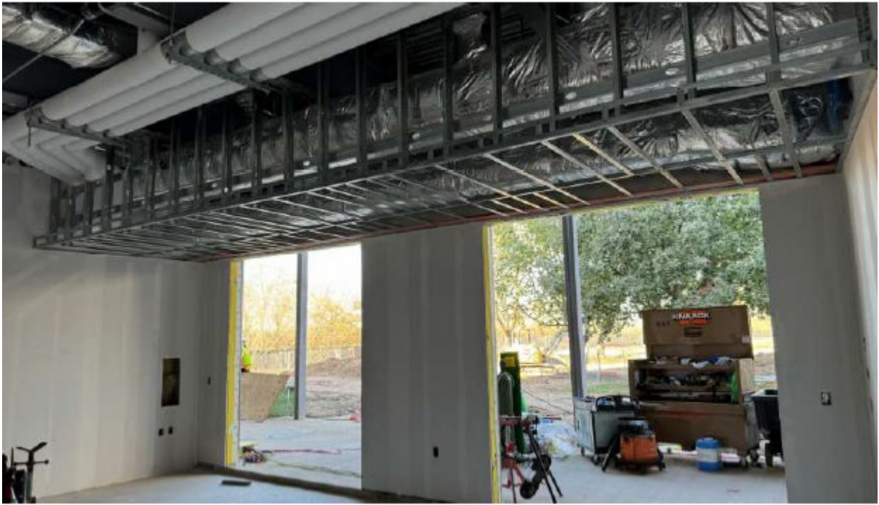
South Addition: Framing soffit at Dance Studio.