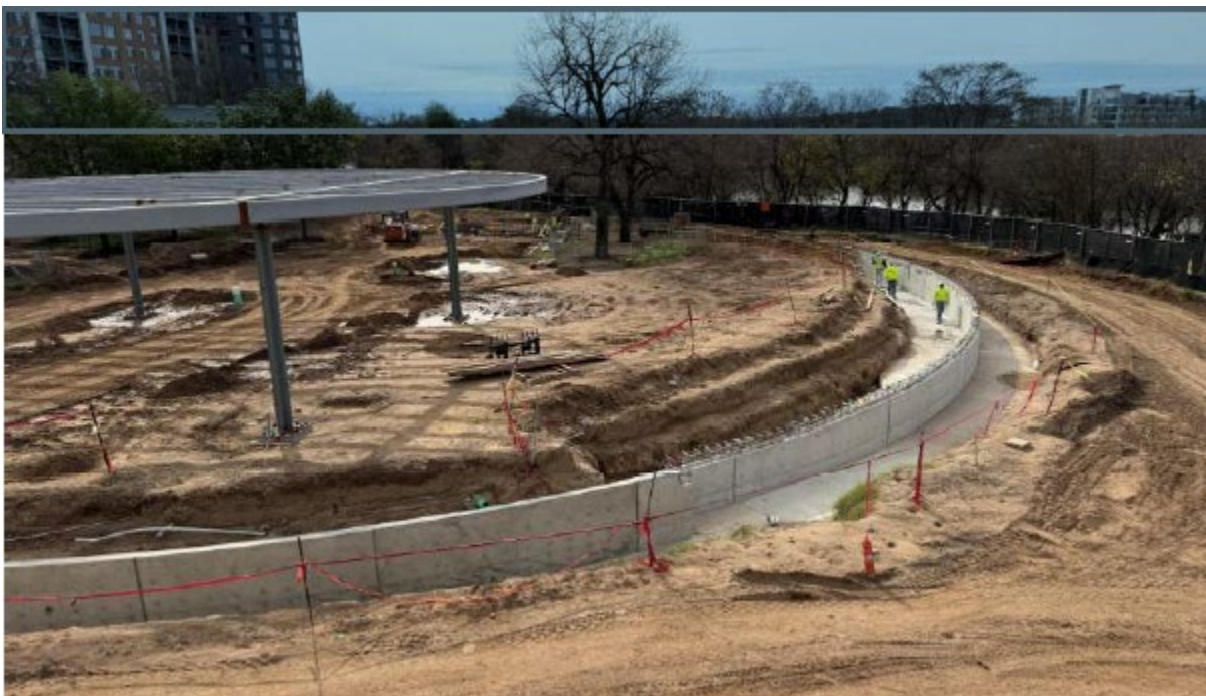
Zocalo: Retaining Wall concrete work in progress.

For project updates, visit the project website: www.austintexas.gov/MaccPhase2