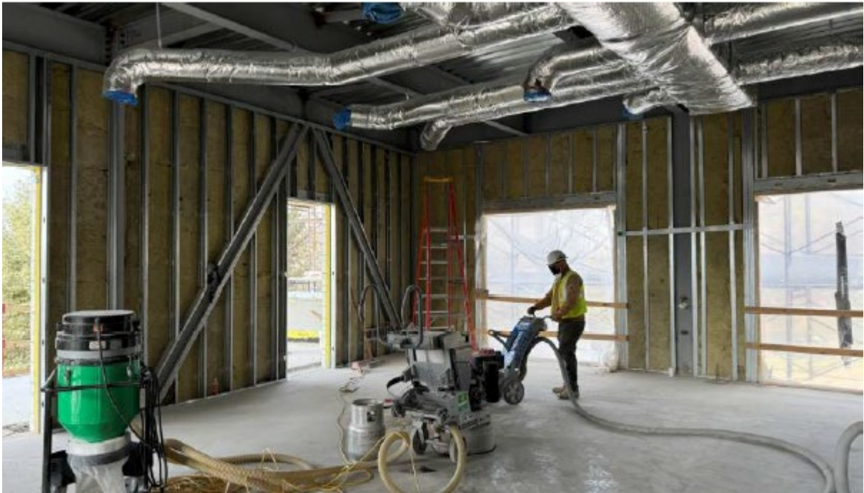
North Addition: Preparing concrete floor for final finish in Art Room.