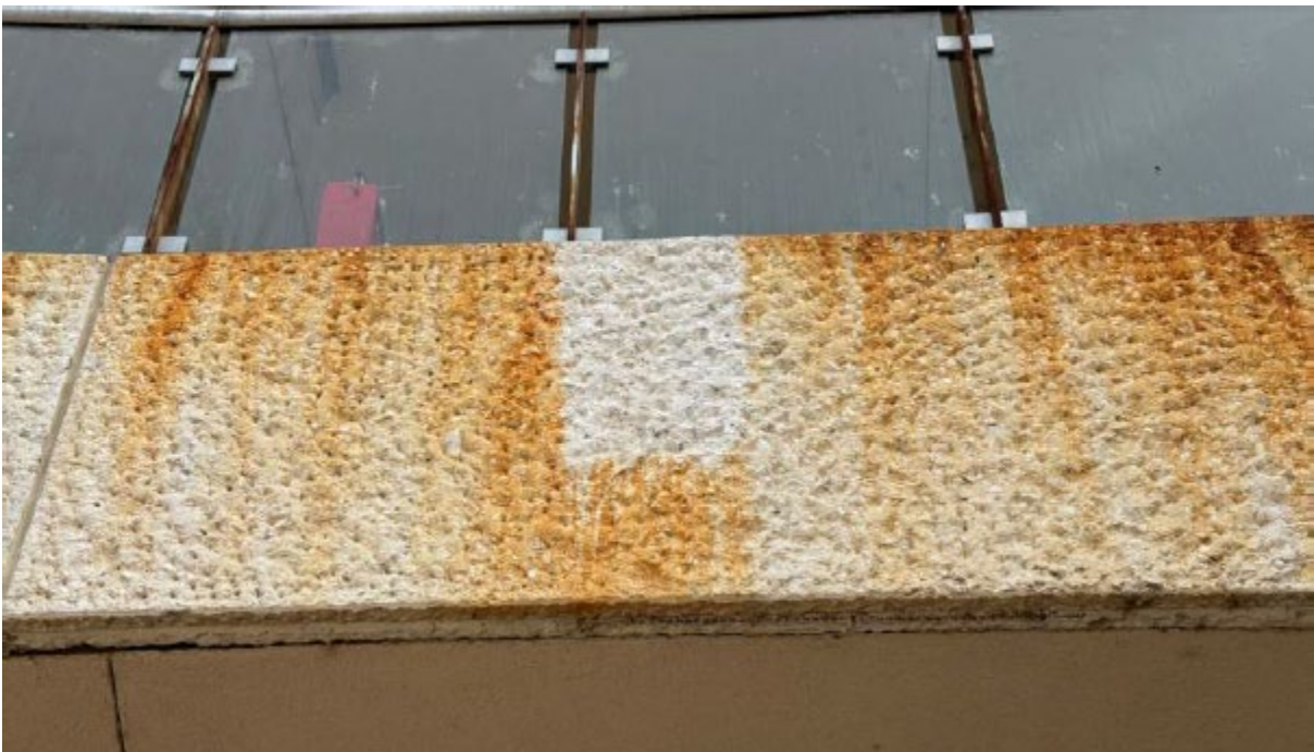
Existing Building: Successful test cleaning of precast panels.