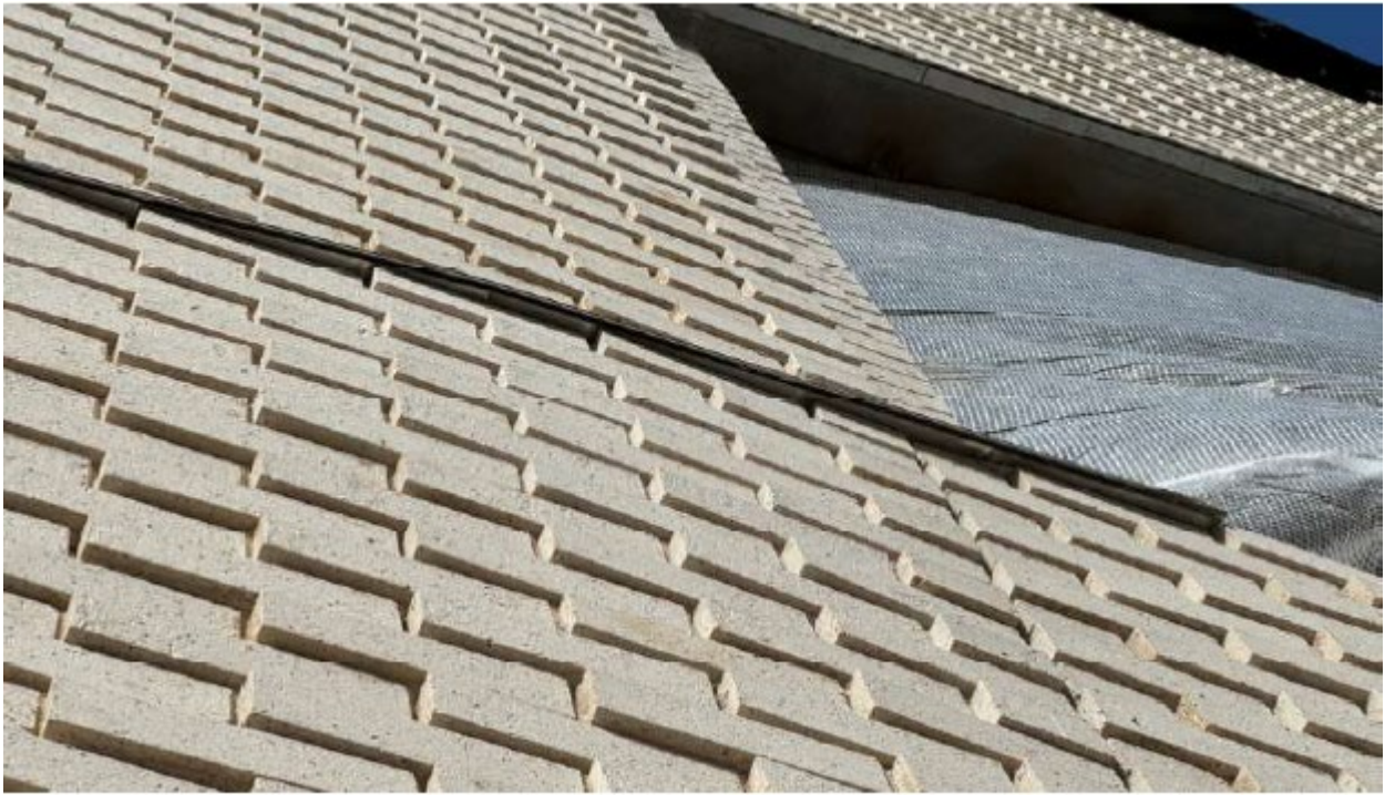
South Addition: Close-up view of brick work detail