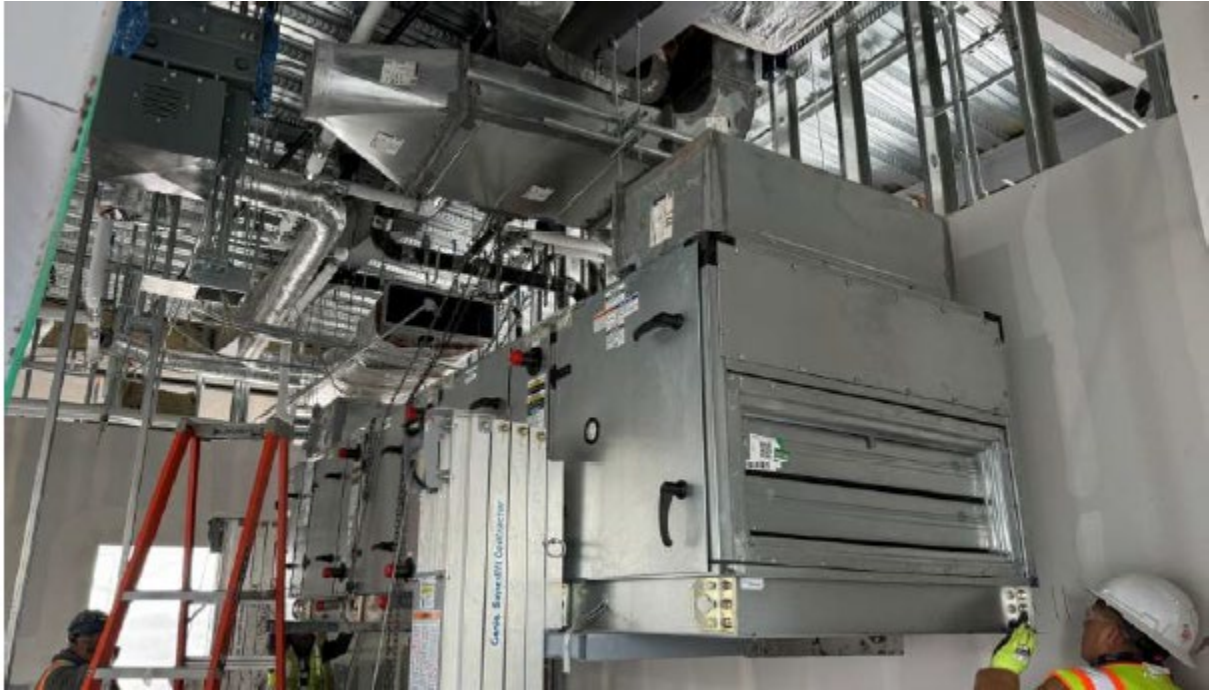
South Addition: HVAC equipment installation