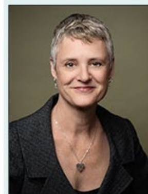
Sen. Sarah Eckhardt