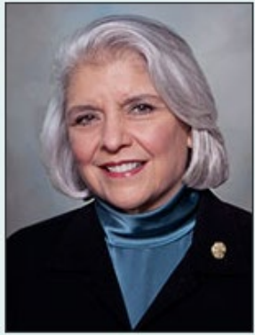
Sen. Judith Zaffirini