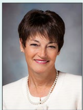
Sen. Donna Campbell