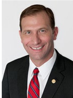
Sen. Charles Schwertner*