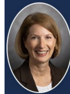
Rep. Vikki Goodwin