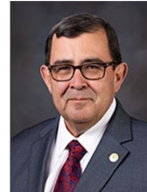
Sen. Pete Flores*