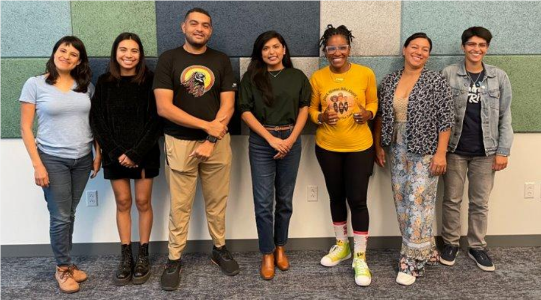
The Rain to River Community Ambassador cohort