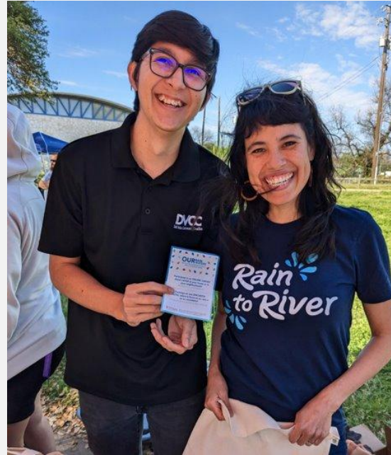
Del Valle Community Coalition and Watershed staff doing R2R outreach