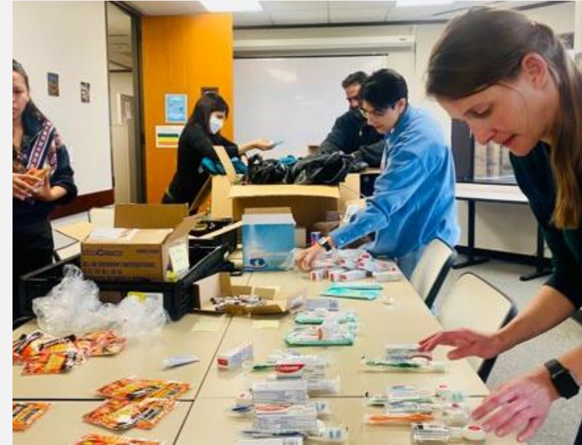
Queertopia and Watershed staff assembling care packages for people experiencing homelessness