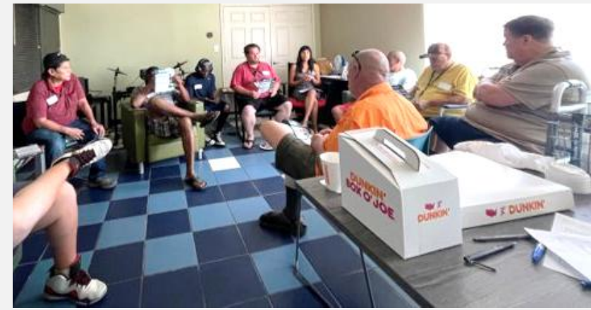
Focus Group with Foundation Communities residents