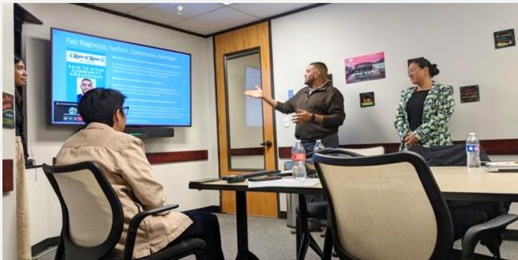
Community Ambassadors share findings with Watershed leaders