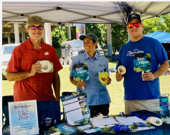
Juneteenth event at Rosewood Park