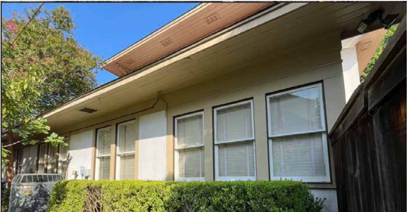
Demolition permit application, 2025