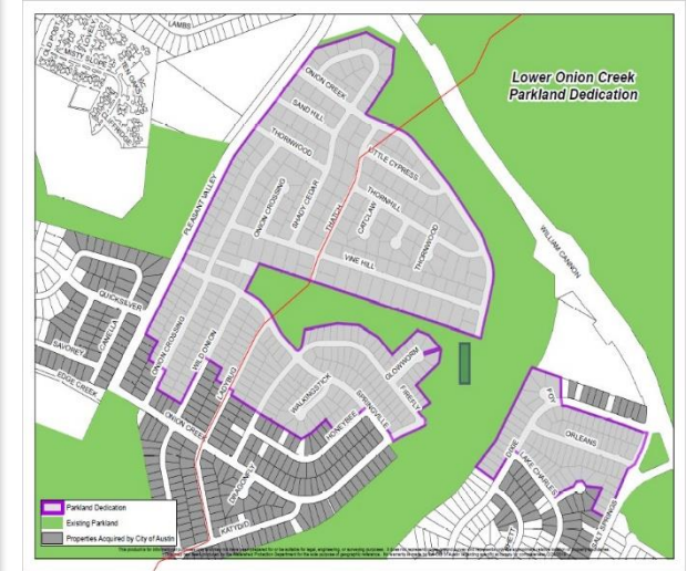
Onion Creek Plantation & Yarrabee Bend Neighborhoods